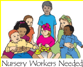
Nursery Workers Needed

Please see the sign up sheet posted on the Nursery Bulletin Board to sign up to help for August, September and October.