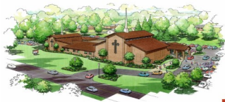
Proposed Addition for Holy Cross Lutheran Church

Holy Cross Lutheran 7707 North Market Avenue North Canton, OH 44721